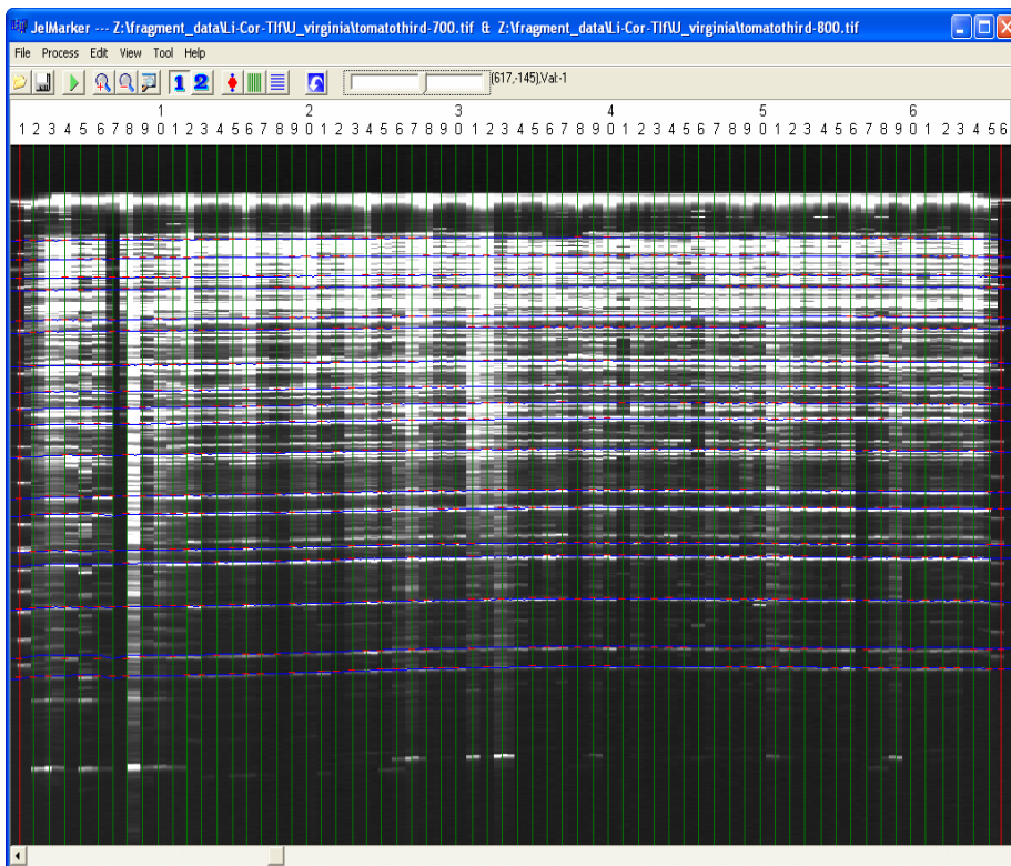
Figure 1. JelMarker – Bands are blue horizontal lines. Lanes are green vertical lines. Standard lanes are red vertical lines.

The Band size standard file is created using the actual blue bands in JelMarker and sized according to the LI-COR size standard chosen (or user created size standard). The SizeStd file is size standard created using the fragments of the lanes identified as standards. When the SCF files are imported into GeneMarker, the yellow dye color will match the SizeStd file and the red dye color will represent the Band file size standard.